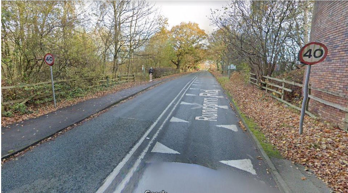
40 / 30 terminal signs approaching from south