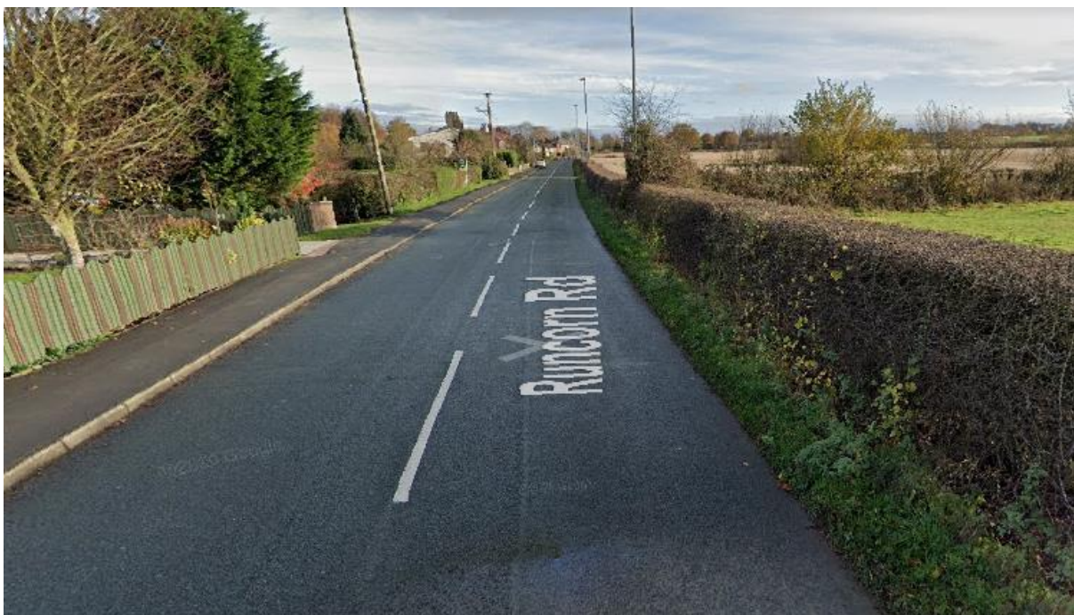
Mid-point of 40 zone, looking north