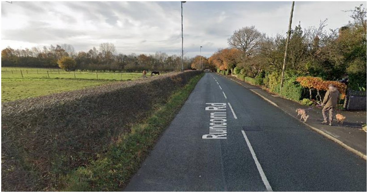
Mid-point of 40 zone, looking south