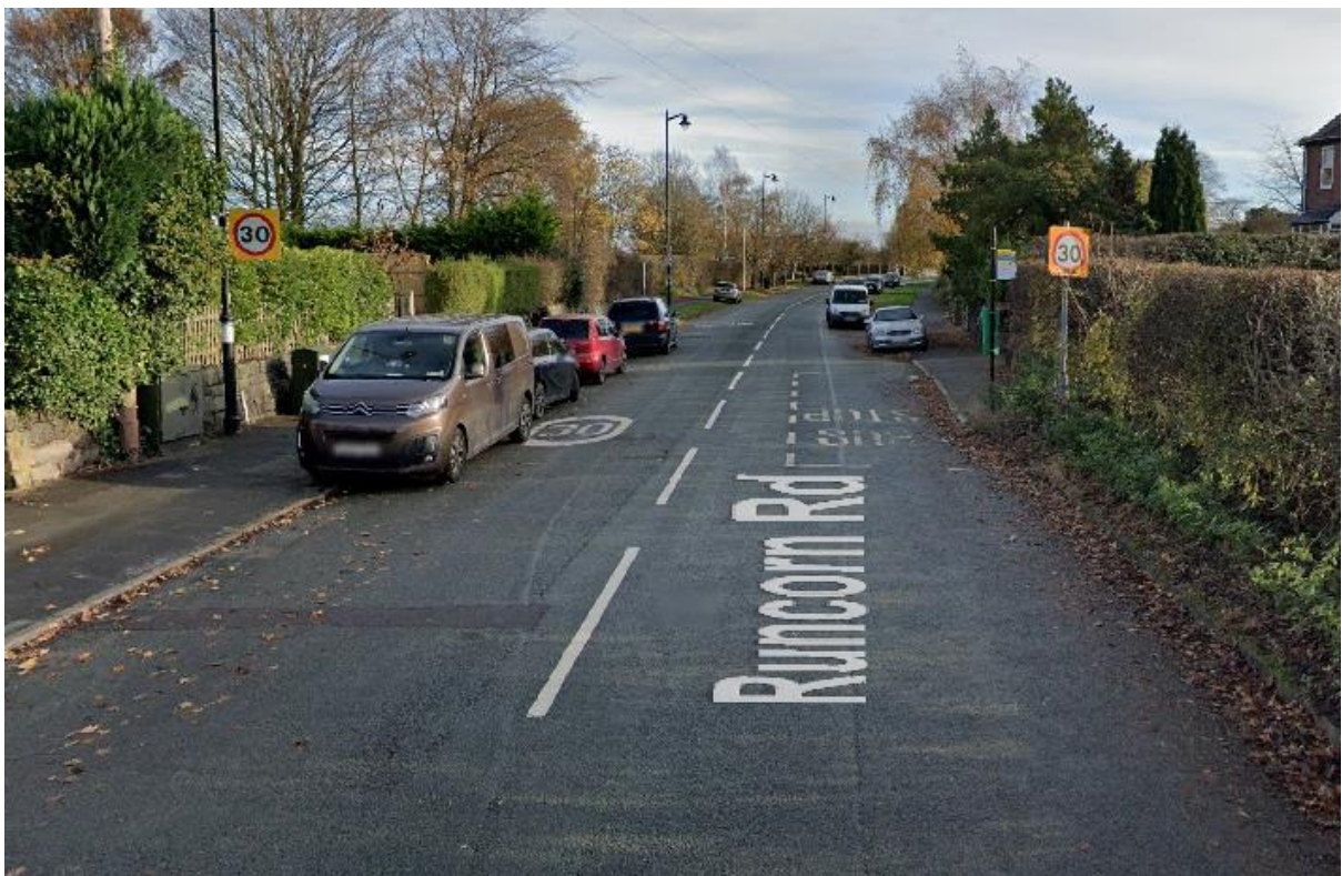
30 / 40 terminal signs, northern boundary